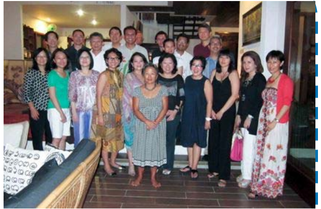
Indonesian, Malaysian and Singaporean Fellows meet to plan conference